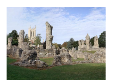
Have you been to Abbey Gardens in Bury St Edmunds?

Edmund was eventually buried In Bedricsworth (now modern Bury St Edmunds), where an Abbey was built. You can go and visit the ruins!