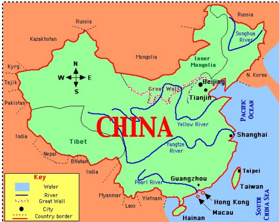
Map of China