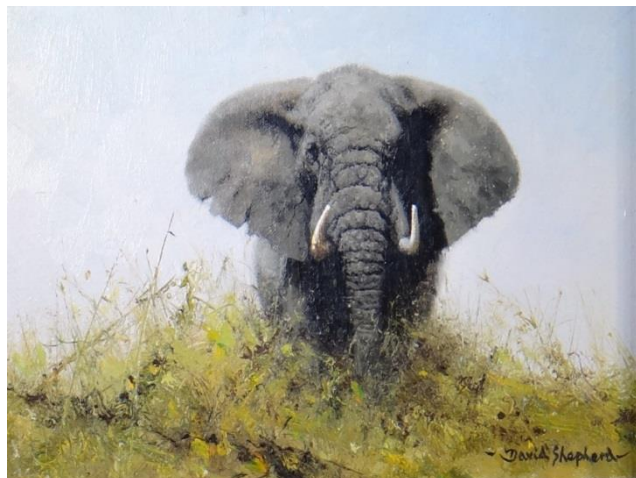
Elephant by David Shepherd, 1987

An English primatologist and anthropologist. She is an expert on chimpanzees and has been studying how they interact in family and social situations.