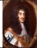
King Charles II

One of the ways we know about the fire is because people wrote about it in their own personal diary.